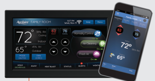
Aprilaire offers a full line of Wi-Fi and wired thermostats for convenient, efficient control of temperature, humidity and all indoor air quality accessories.

Aprilaire Wi-Fi thermostats with IAQ control provide the most convenient and accurate control of humidity and temperature. The thermostat works with the Auto-Trac® feature to automatically deliver optimal humidity. Automatic humidity control is integrated into the thermostat and you can easily control temperature and humidity levels from anywhere with the app on your mobile device. The app also allows you to control other installed Aprilaire IAQ products for optimal fresh air ventilation and air purity and keeps you up-to-date about changing climate conditions in your home.