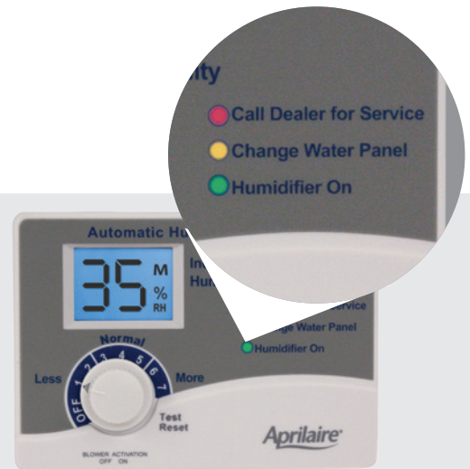
Automatic Digital Control mounted on a heating system

The Aprilaire Automatic Digital Control mounts on your heating system and features Auto-Trac® to automatically deliver the optimal amount of humidity. It features a convenient display and indicators for relative humidity levels, operation status and service needs. For more precise humidity control and preservation, we suggest the wall-mounted digital display humidistat.