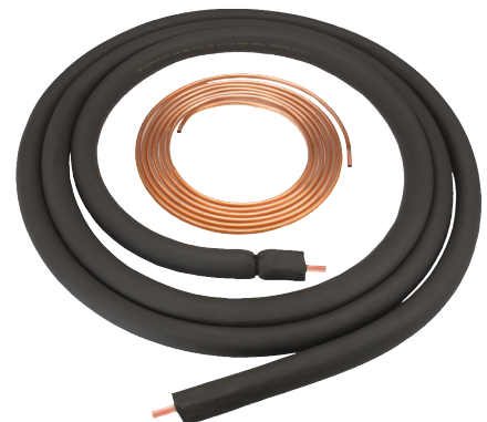
Sweat Fit Line Set