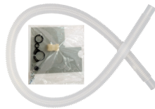
Coil Accessory Kit